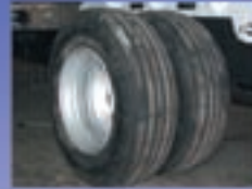
Super 19 1/2" Wide Implement Tires