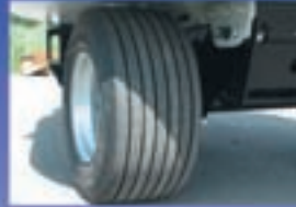
Tight Radius Walking Tandems With Implement Tires